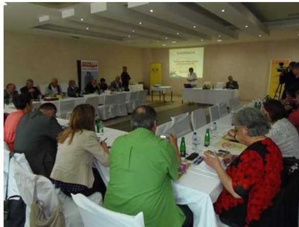
Consumer protection conference

Activities within the project we have increased the number of informed traders, service providers, and citizens about the Consumer Protection Law in Republic of Srpska and holders of consumer protection. Also initiative for forming of the branch offices for consumer protection within NGO DON was initiated. Cooperation between holders of consumer protection in RS and Prijedor region has developed.