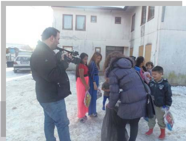
Humanitarian aid for Dobož

Within the action we collected sweets, grocery and hygienic products and packed 875 child packets for children from socially endangered families in Prijedor.