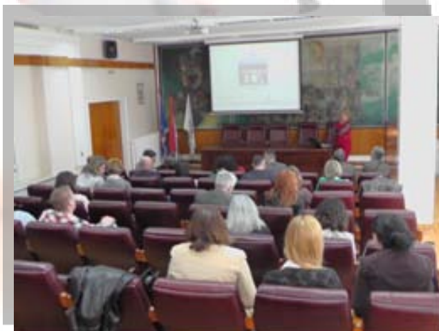
Study visit to Pančevo 21-22.03.2014.

These strategies determine the conditions for sustainable development of the non-profit social housing and method of providing and using funds for the development of non-profit social housing, the method of allocation and use of housing units, as well as other issues of importance for the non-profit social housing.